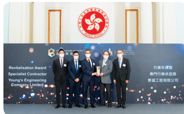
Young's Engineering team received the "Revitalisation Award – Specialist Contractor" presented by the Permanent Secretary for Development at Government House