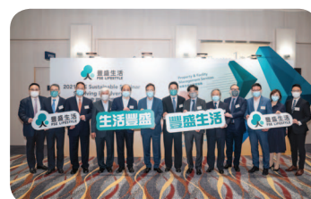
FSE Sustainable Seminar aims to encourage our staff to continuously improve their service standards and contribute to the betterment of our Group and the society at large