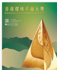
"Hong Kong Awards for Environmental Excellence 2020"