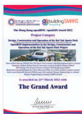
The Grand Award of the Hong Kong openBIM/openGIS Award 2022 for our Kai Tak Sports Park project