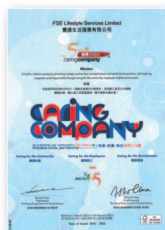
FSE Lifestyle and our business units continued to receive the Caring Company certifications and logos