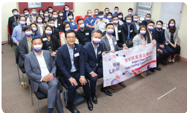
Waihong frontline staff won several awards, both individually and as a company, in the "Toilet Cleaning Competition 2021" Award Presentation Ceremony