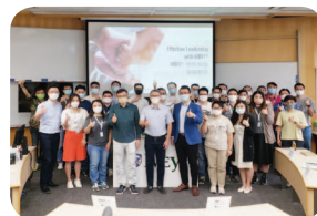
FSE Executive Development Programme's workshop on "Effective Leadership with Myers-Briggs Type Indicator" held on 24 June 2022