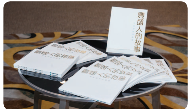
FSE Lifestyle’s VMV books present the successful and encouraging stories of our staff