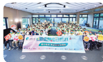
In the FSE Caring Day, FSE Lifestyle's staff continued to promote the spirit of caring for the community and serving people in need