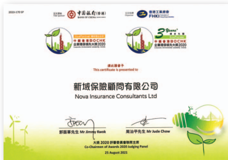
Nova received the “BOCHK Corporate Environmental Leadership Awards 2020 – Eco Partner”